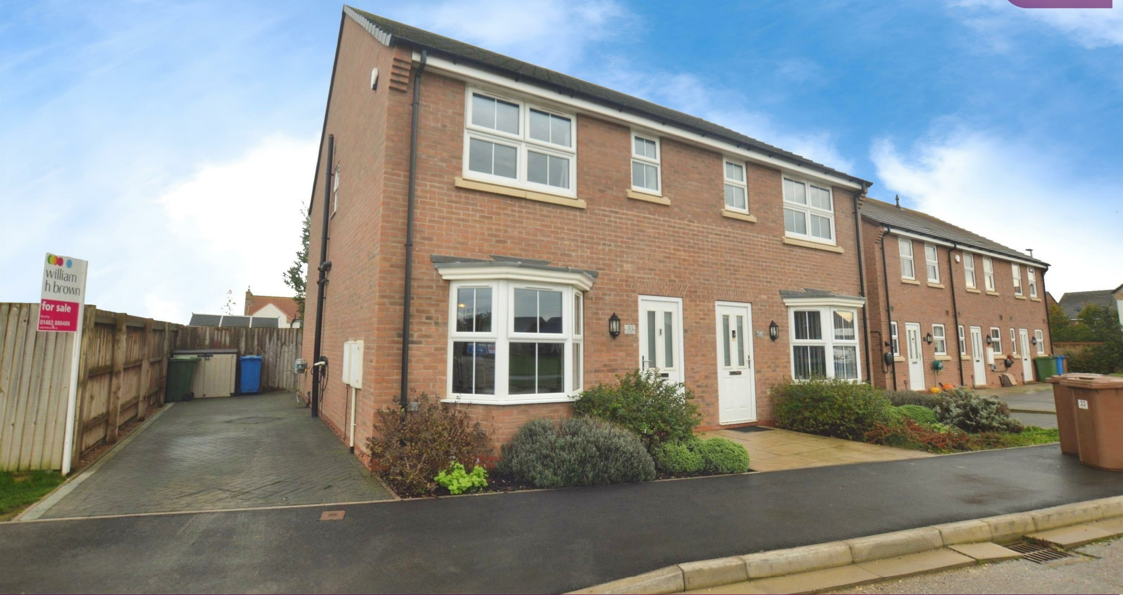
33 Twiss Meadow, Beverley, HU17 8YU £245,000